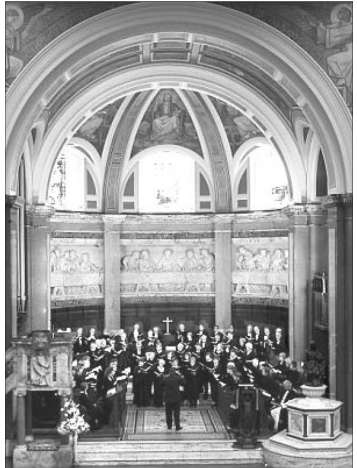
The Chancel Choir, joined by members of St. Louis Metro Singers, provided music for Sunday worship at the Parish Church of St. Cuthbert in Edinburgh, Scotland on June 12. Additional photos of the choir's trip to Great Britain appear on page six and on the Chancel Choir Web site.