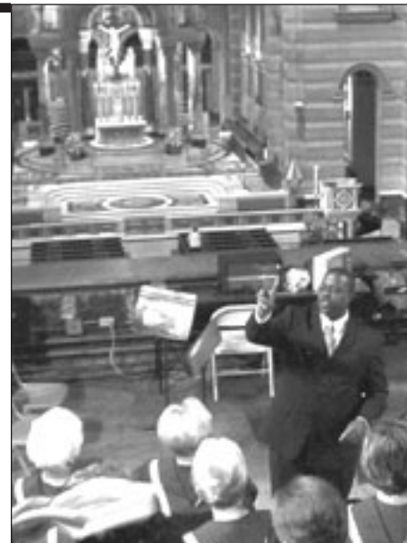
The Chancel Choir sings for Mass at the St. Louis Cathedral Basilica as an outreach to the community.